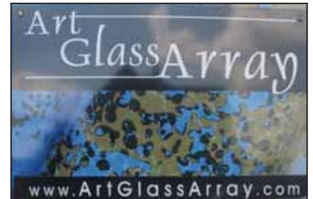
AGA - Art Glass Array 501 N. Kingshighway St. Charles, MO 63301