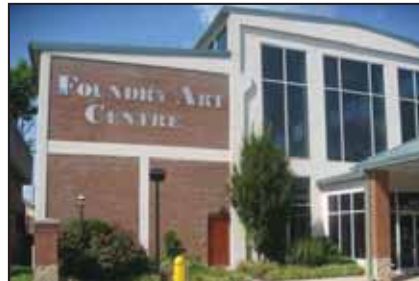
FAC- Foundry Art Centre 520 North Main Street St. Charles, MO 63301

Please be sure to note the location when you register for your class.